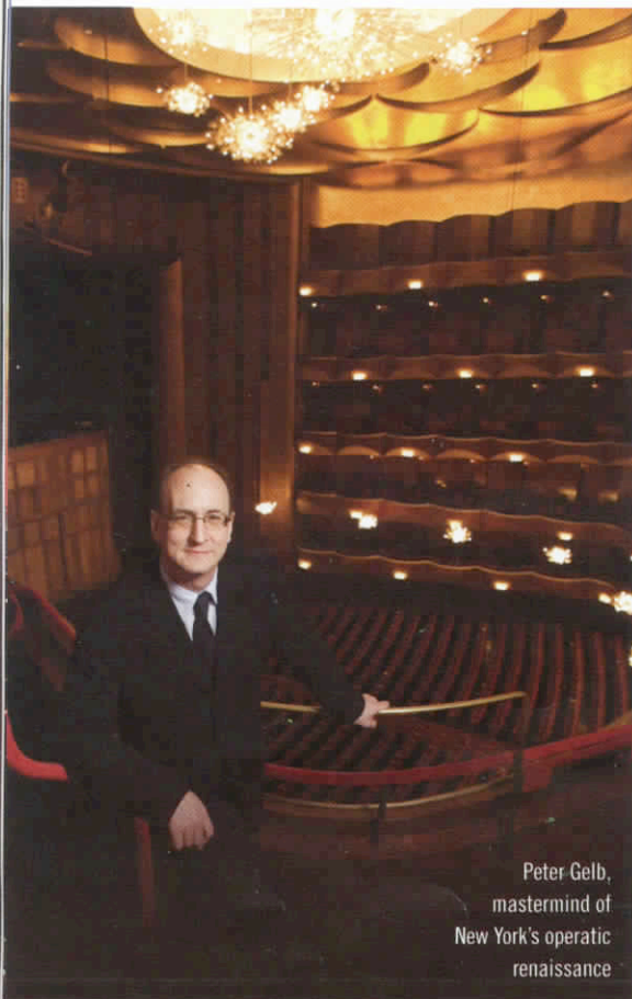
Peter Gelb, mastermind of New York's operatic renaissance

The programming at the Met has traditionally been built around the tastes and ambitions of rather autocratic impresarios, foremost among whom was Sir Rudolf Bing, general manager from 1950 to 1972.